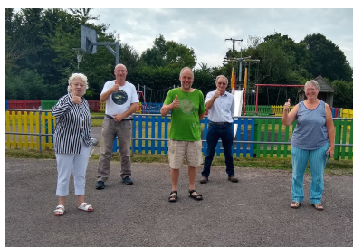
Board members celebrating approval of application

As you will know, our planning application for 15 affordable homes was reviewed by the Dorset Council planning committee in August. I am delighted to tell you that it was unanimously approved, subject to an S.106 legal Agreement, which will ensure their status as affordable homes for people with a local connection in perpetuity. At the planning committee meeting it was refreshing to hear the scheme being heaped with praise from many Ward Councillors. Dorset Council insisted on provision of a footpath to run from the site to meet the existing right of way that runs to the Chard Road, and this was included in the application. This means that residents will be able to walk from the site to the Village Hall, the playground and sports field, having to cross only one road.