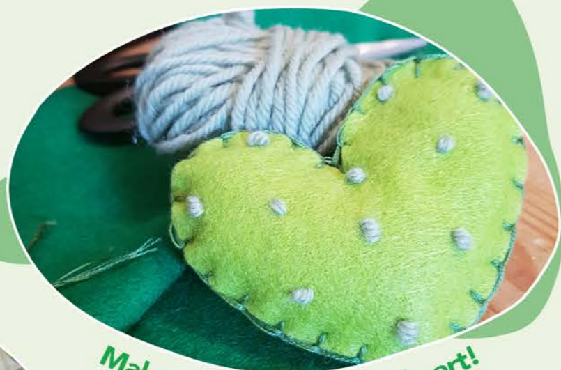
Make and wear a green heart!

Ever since the start of Show the Love, communities across the UK have demonstrated year-on-year that beautiful things are possible when people work together. Things may look a bit different this year, but you can still show the love! Don't forget to put photos of your creations on social media and use the hashtag: #ShowTheLove , tag us as @theccoalition on Twitter and @theclimatcoalition on Facebook and Instagram.