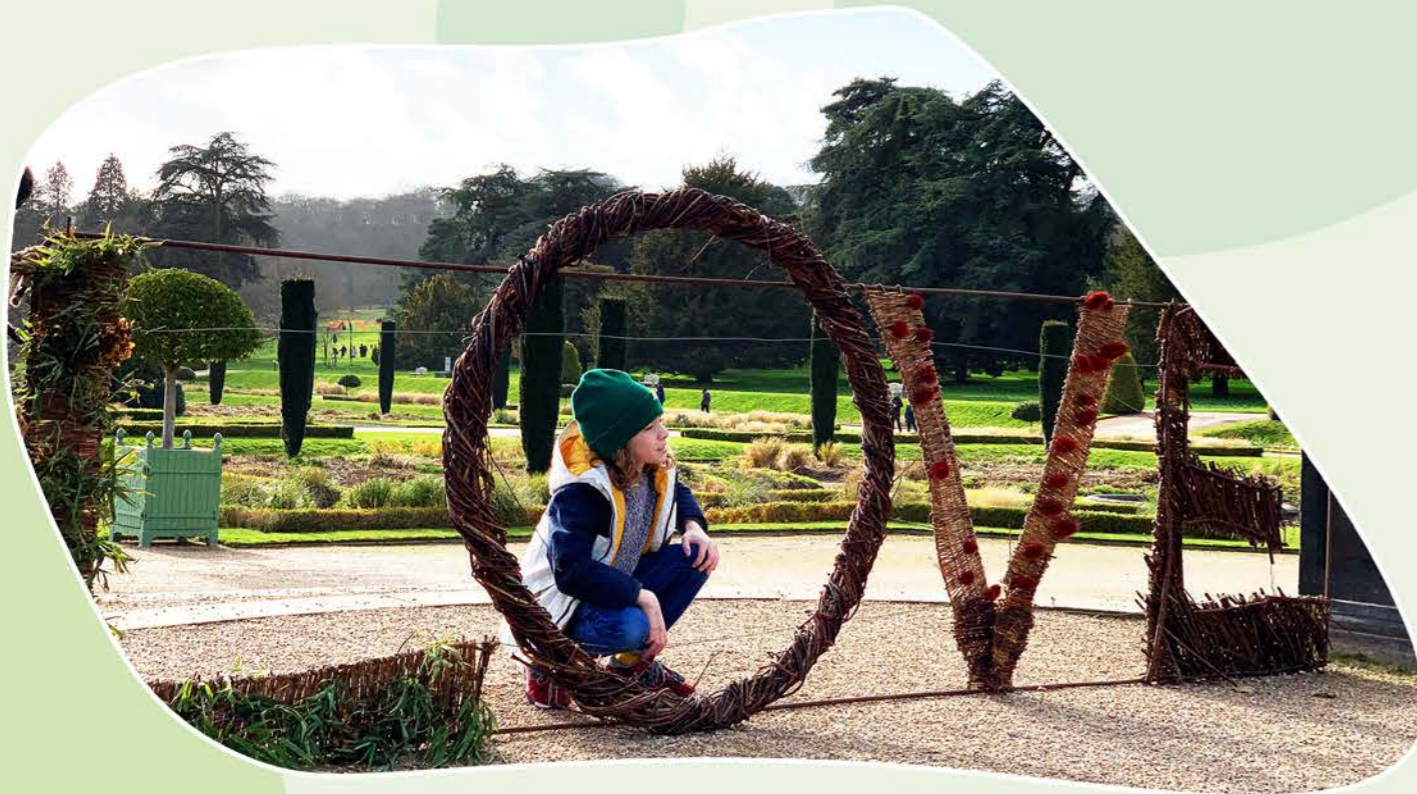
The Trentham Estate's beautiful installation encouraged climate conversations.

To mark Show the Love 2021, perhaps you could turn your garden into a wildlife and wildflower haven and help protect our precious pollinators! You can find tips on how to do this at theclimatecoalition.org/wildlife-gardening