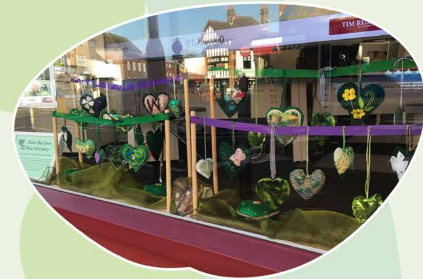
Beaconsfield WI's head-turning display of green hearts in the window of a local estate agent.