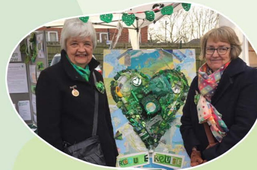
Towcester Evening WI's shared their upcycled green heart at their local farmer's market and it became a window display throughout lockdown.

Each year displays pop up across the UK as people show the love. We see events in libraries, places of worship, community centres, shopping centres, sportsgrounds and more! Join us to show the love this year by creating your own green heart displays in your community, and in your window or front garden for Valentine's Day weekend!