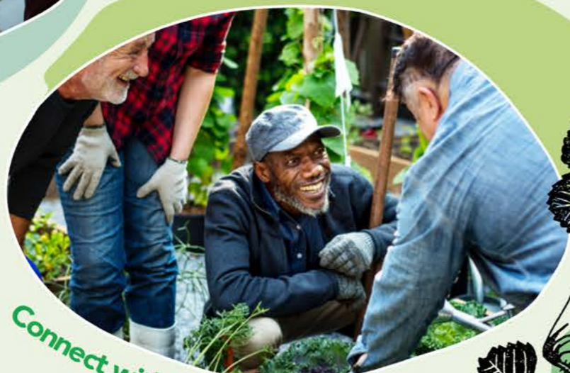
Connect with your community!