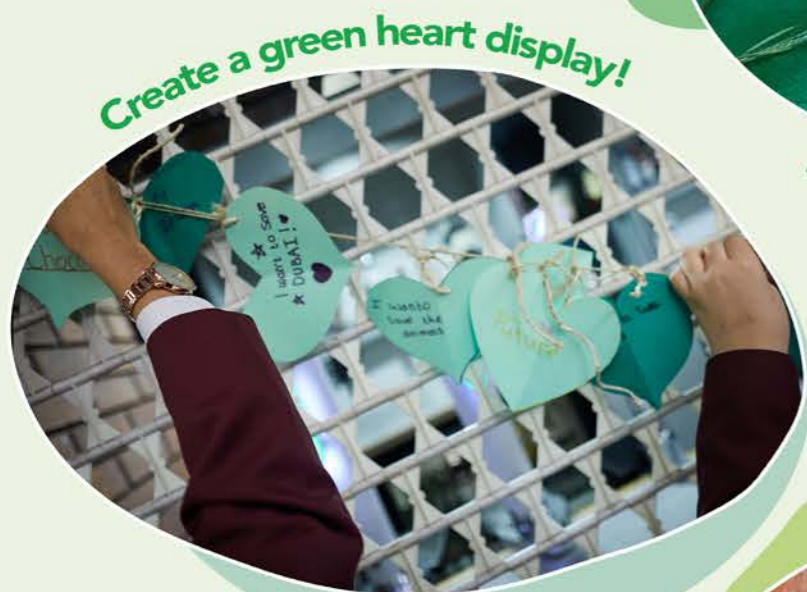
Create a green heart display!