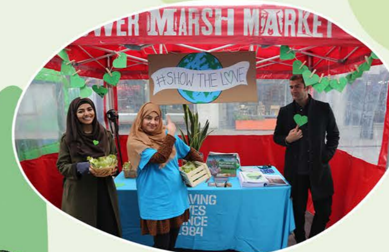
Islamic Relief's Show The Love stall at Lower Marsh market in London.