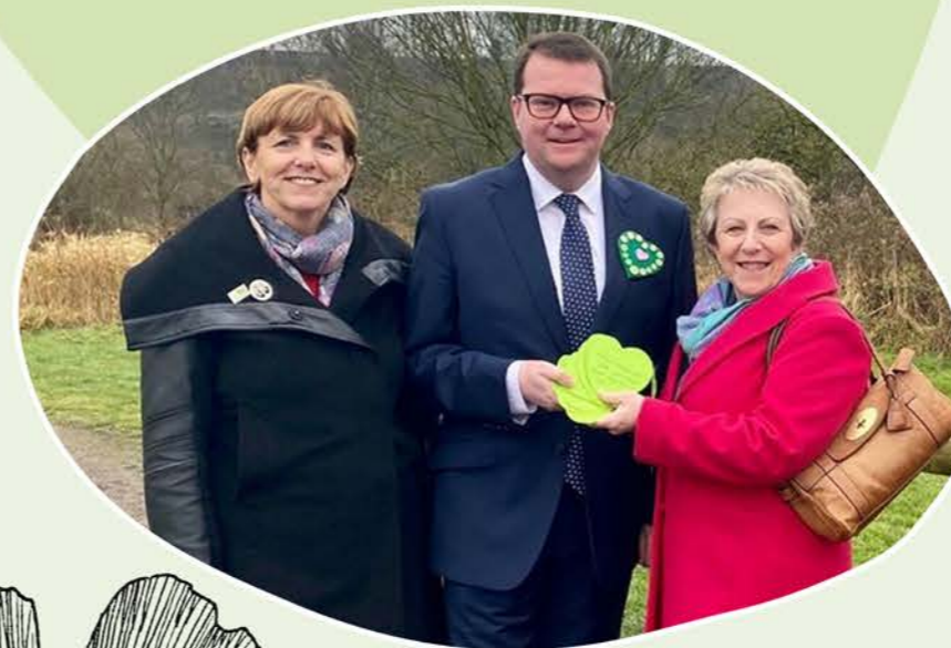
Viaduct Violets WI presented a green heart to their MP, Conor McGinn MP and spoke about the impacts of climate change in Lancashire.