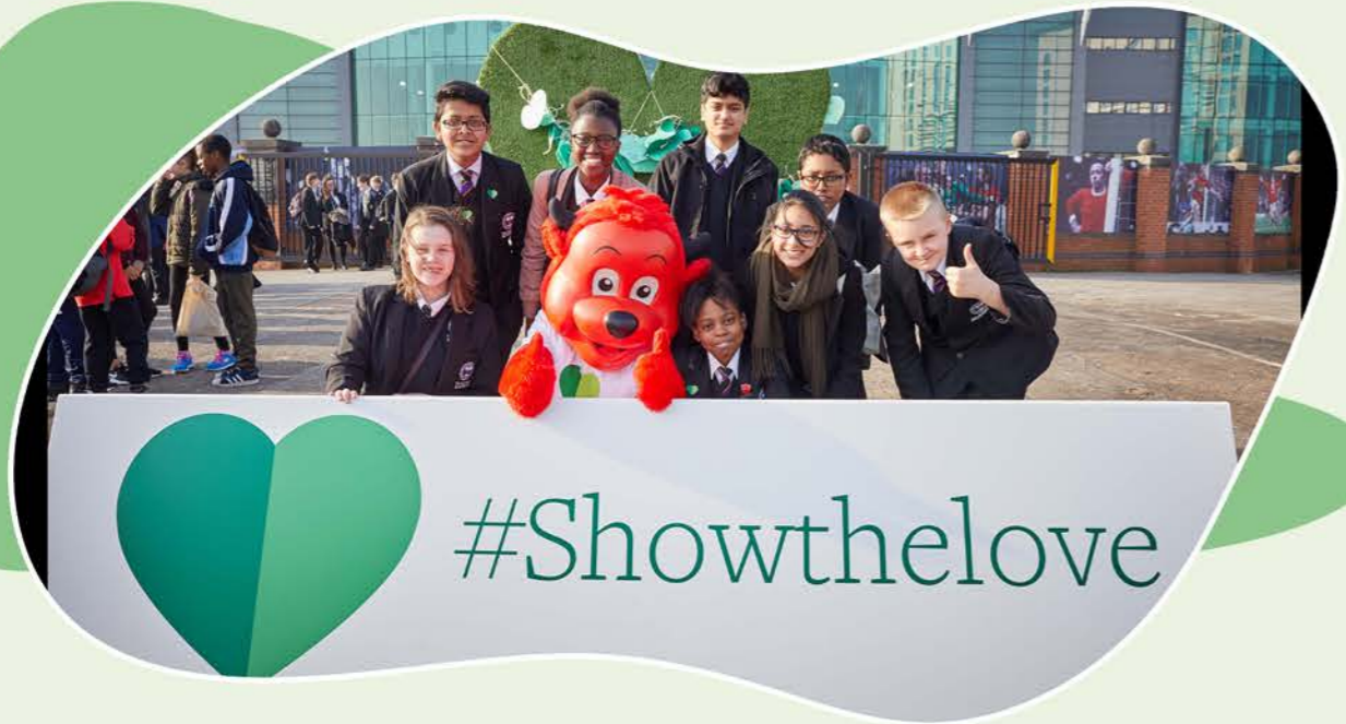
Manchester United Foundation shows the love!

For the past few years, Manchester United Foundation has hosted children from local schools at the Old Trafford Stadium to learn more about protecting what they love from climate change. Could your group connect with a local school to show the love for your local area? Our schools resources are full of ideas and activities for school groups.